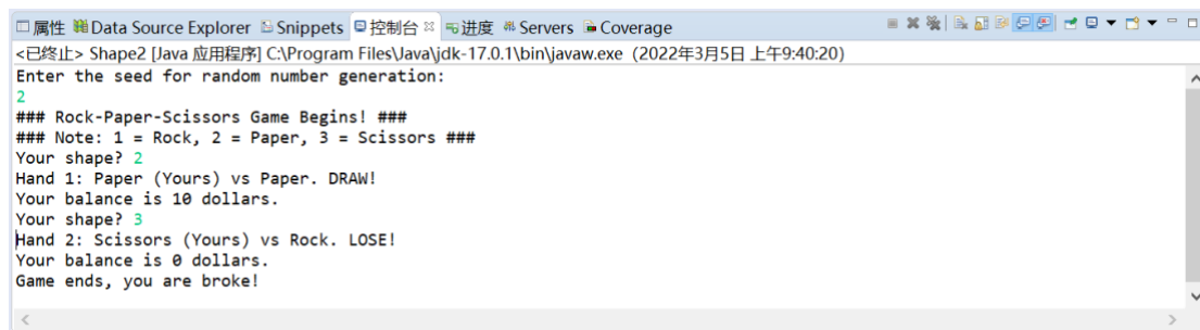
Figure 2: A run of the advanced level Rock-Paper-Scissors program with 2 as the seed.

Run 1: Figure 2 shows a run with 2 as the seed. We lose the game after 2 hand. The result of your game is shown right after a hand is dealt to you.