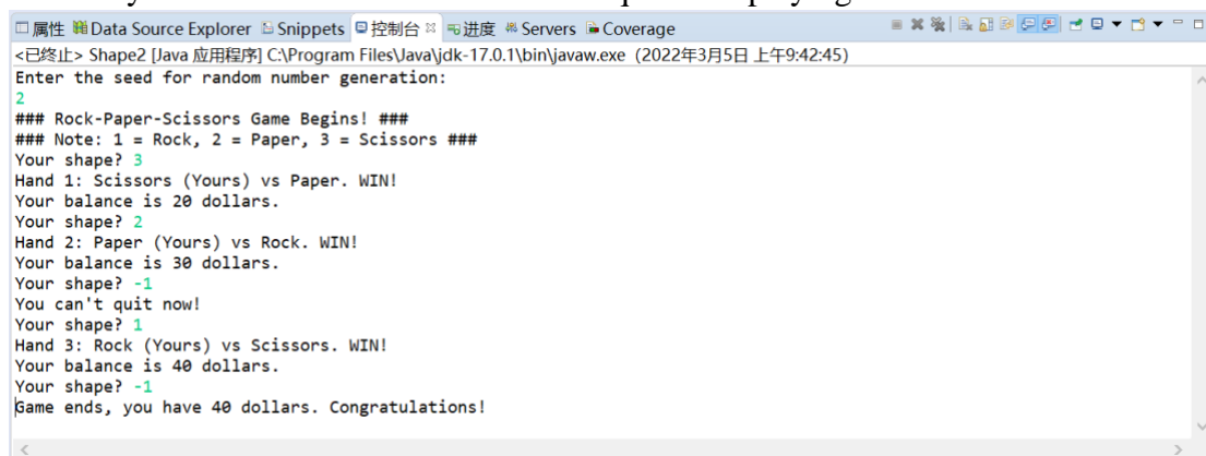
Figure 3: A run of the advanced level Rock-Paper-Scissors program with 2 as the seed.

Run 2: Figure 3 shows a run with 2 as the seed. We wanted to quit at the third hand, but the system does not allow that. We can quit after playing at least 3 hands.